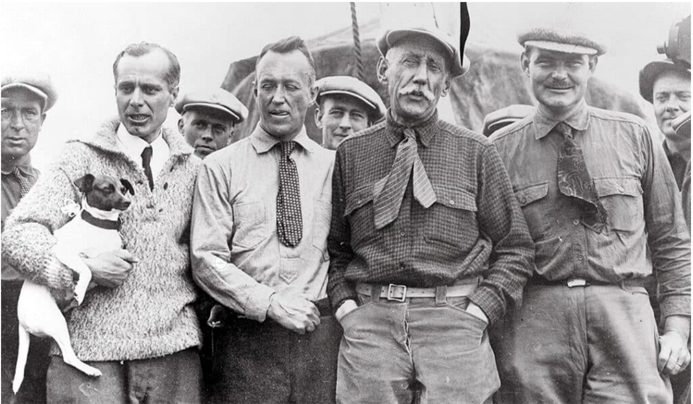
The crew of the “Norge” celebrates in Seattle: Umberto Nobile (with dog), right beside him Lincoln Ellsworth and Roald Amundsen (with moustache).